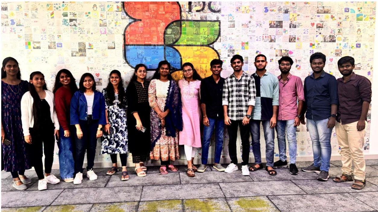
STUDENTS VISITED MICROSOFT OFFICE